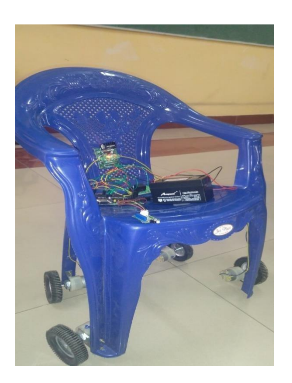
Fig d): Interfacing of Android Smart phone and the wheelchair.

By utilizing the methodology equipment setup is done in fig. (d) Demonstrates the interfacing of Android Smart phone and the wheelchair.