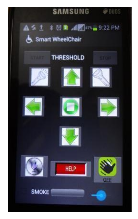
Fig. e) shows the Android application for the operation of Wheelchair.