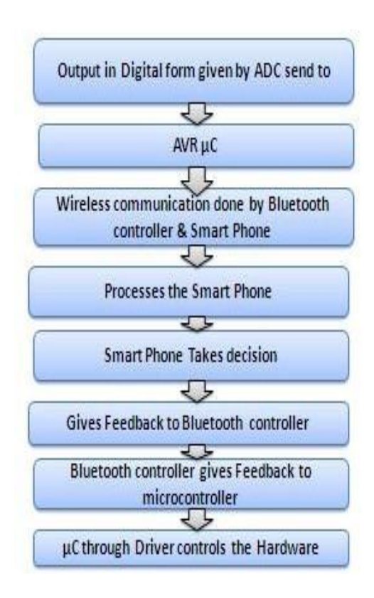
Fig. c) demonstrates the stream graph of operation of control of AVR with Smart phone.

To test the module, I initially associated it to my Laptop. This makes it less demanding to see whether the module is accepting characters or not. By essentially utilizing a terminal program like hyper terminal to imagine what the module is sending from its serial interface.